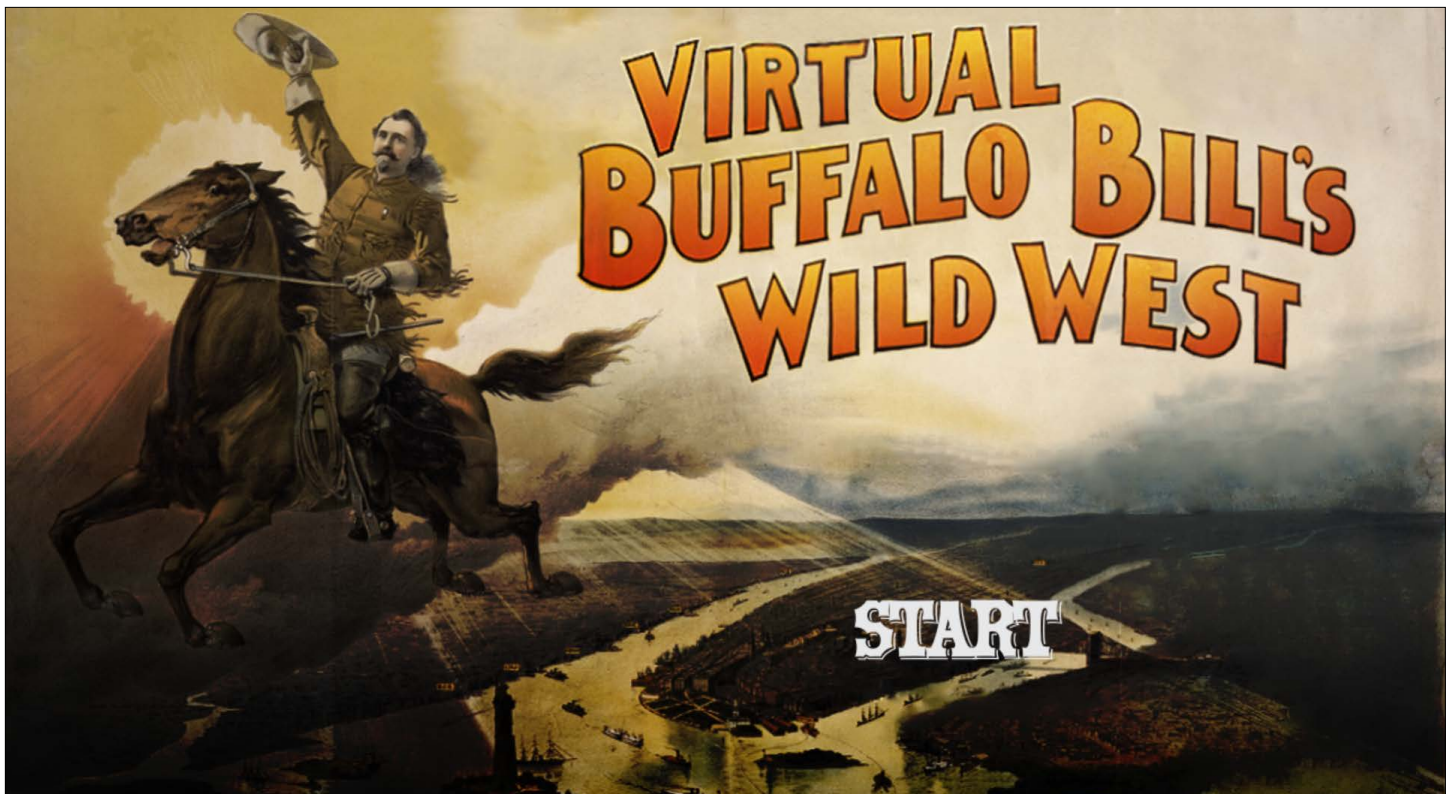
Screenshot from the Virtual Buffalo Bill's Wild West. IDIA Lab, Ball State University. 2015

Hybrid Design Technologies, through the Office of Information Technology is an evolutionary extension of the IDIA Lab's innovation in virtual and hybrid environments. This newsletter includes updates on current IDIA Lab projects including the launch of our Virtual Companion iOS augmented reality app; the development of the Virtual Buffalo Bill Wild West Show for the Cody Center of the West Museum in Cody, WY; a collaborative community celebration of the Muncie Sesquicentennial using digital media; our Wonders of Oz app on Google Play and Apple Store and an Android game for at-risk international youth.