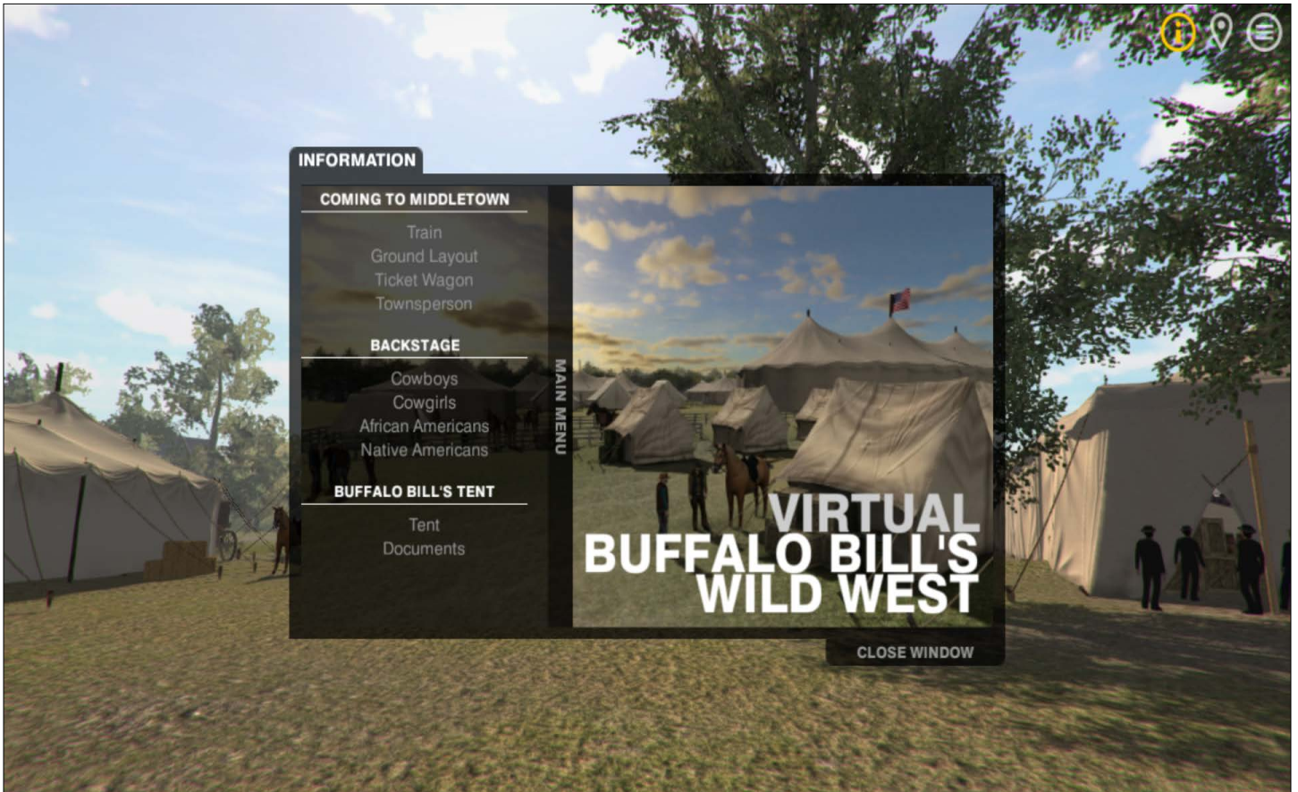
Screenshot from the Virtual Buffalo Bill's Wild West. IDIA Lab, Ball State University. 2015