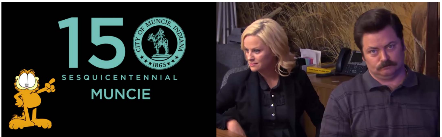
Muncie Sesquicentennial. IDIA Lab, Ball State University. 2015. Paws, LLC. Parks and Recreation, NBC.

http://idialab.org/buffalo-bills-wild-west-gets-a-virtual-makeover/