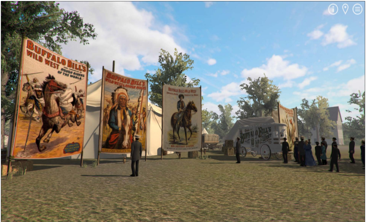
Screenshot from the Virtual Buffalo Bill's Wild West. IDIA Lab, Ball State University. 2015