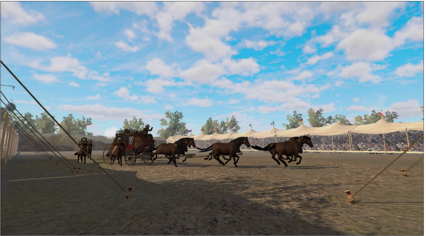
Screenshot from the Virtual Buffalo Bill's Wild West. IDIA Lab, Ball State University, 2015